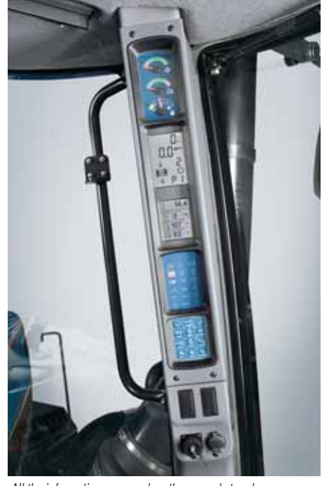
All the information you need on the go and at a glance — you can monitor everything from wheel slip and ground speed to fuel usage and hydraulic-flow readings with the optional performance instrumentation that's integrated into the cab post for easy viewing.

Depending on the T9000 model, there are a total of 12 halogen work lights — eight of which are adjustable. additional High-Intensity Discharge (HID) lamps provide 110 meters of illumination to the marker trail during night operation. For added safety, twin rotating beacon lights are std.